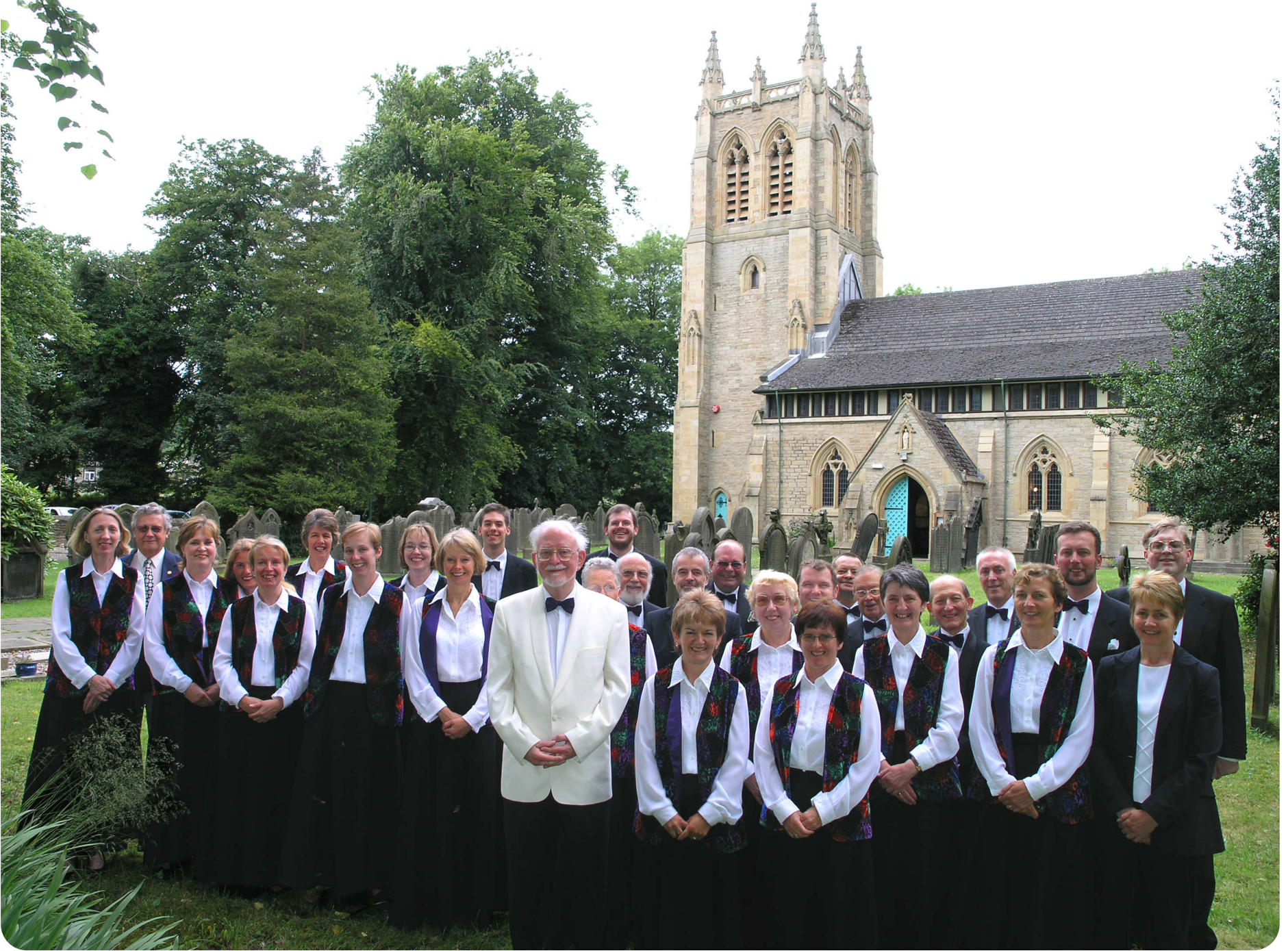
The Huddersfield Singers prior to the Summer Concert, Surrounded by Summer , on 2nd July 2005